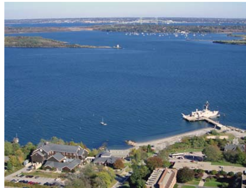
Don Bousquet & Son Aerial Photography

Peter B. Lord, Environment Writer, The Providence Journal