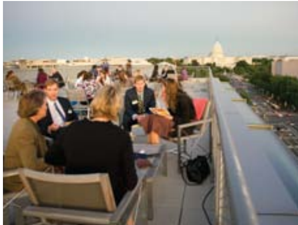
Guests enjoy the view during the evening reception.

Under secretary of commerce for oceans and atmosphere, following her guest appearance at the 2009 Grantham Prize Seminar.