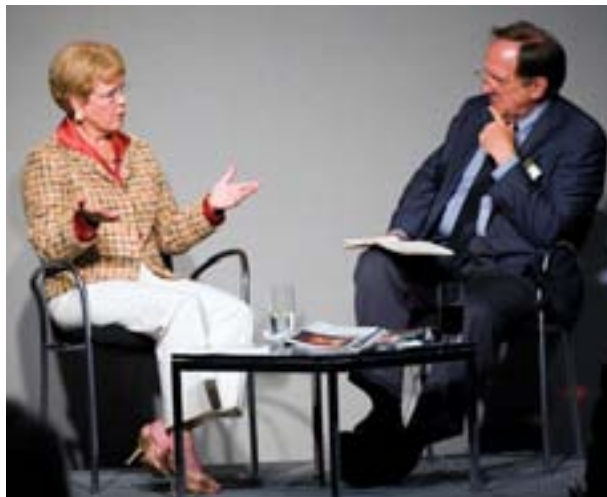
Dr. Jane Lubchenco discusses ocean policy with Bill Blakemore.

Read about all the 2009 winners, view the archived seminar and winner's presentations, and learn more about The Grantham Prize at www.granthamprize.org .