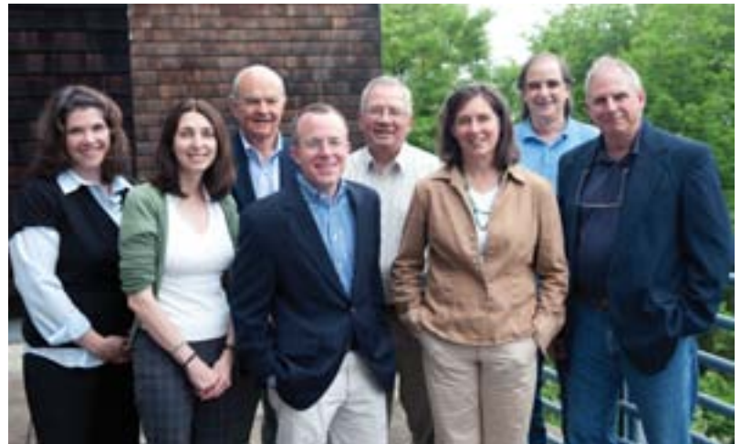
Members of the Metcalf Institute Advisory Board gathered for a photo prior to the June board meeting.

*These donors made special gifts in support of the 2009 Annual Science Immersion Workshop for Journalists and the 2009 Annual Public Lecture Series.