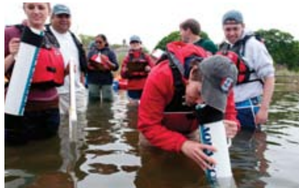
Metcalf fellows measure biodiversity in a coastal lagoon.